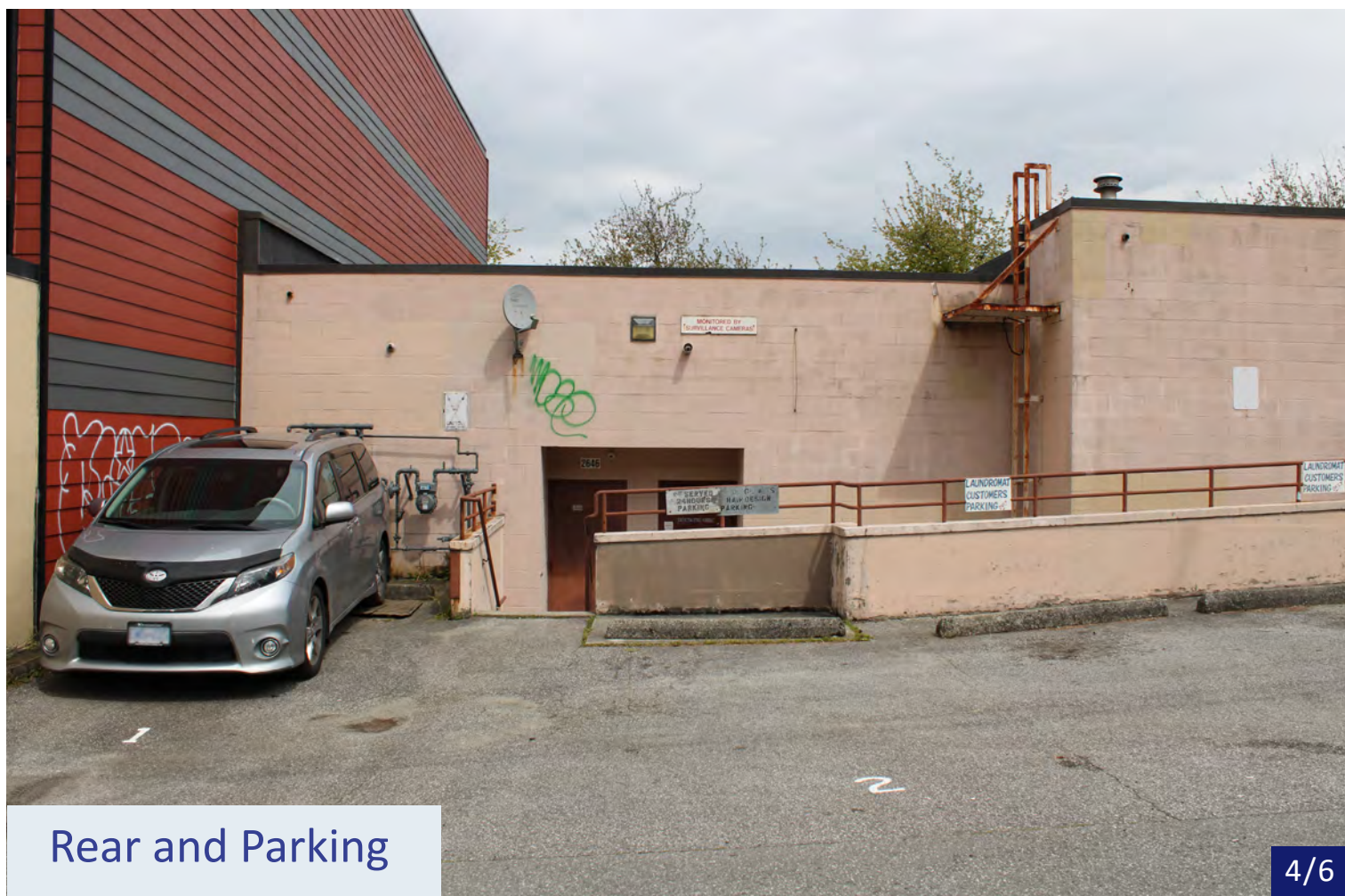
Rear and Parking